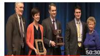
Luncheon NC GIS Conference 63 views • 1 month ago