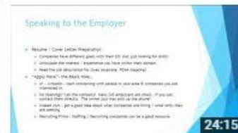
Getting Hired In The Real World Of GIS 245 views • 1 month ago