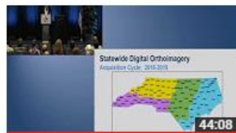
The State of GIS in North Carolina NC GIS Conference 25 views • 1 month ago