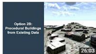
GIS For Flood Risk And Climate Change Applications 303 views • 1 month ago