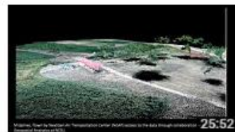
OpenDroneMap Present And Future 288 views • 1 month ago