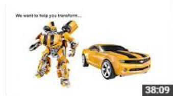
The Underutilization Of GIS And How To Cure It 908 views • 1 month ago