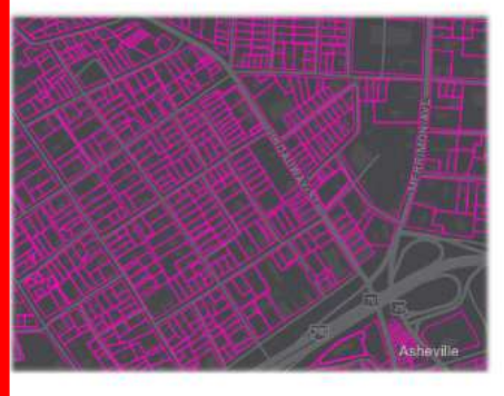
NC Parcels Program Statewide Standardized Parcel Dataset