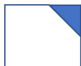
Annexation Area (blue triangle)