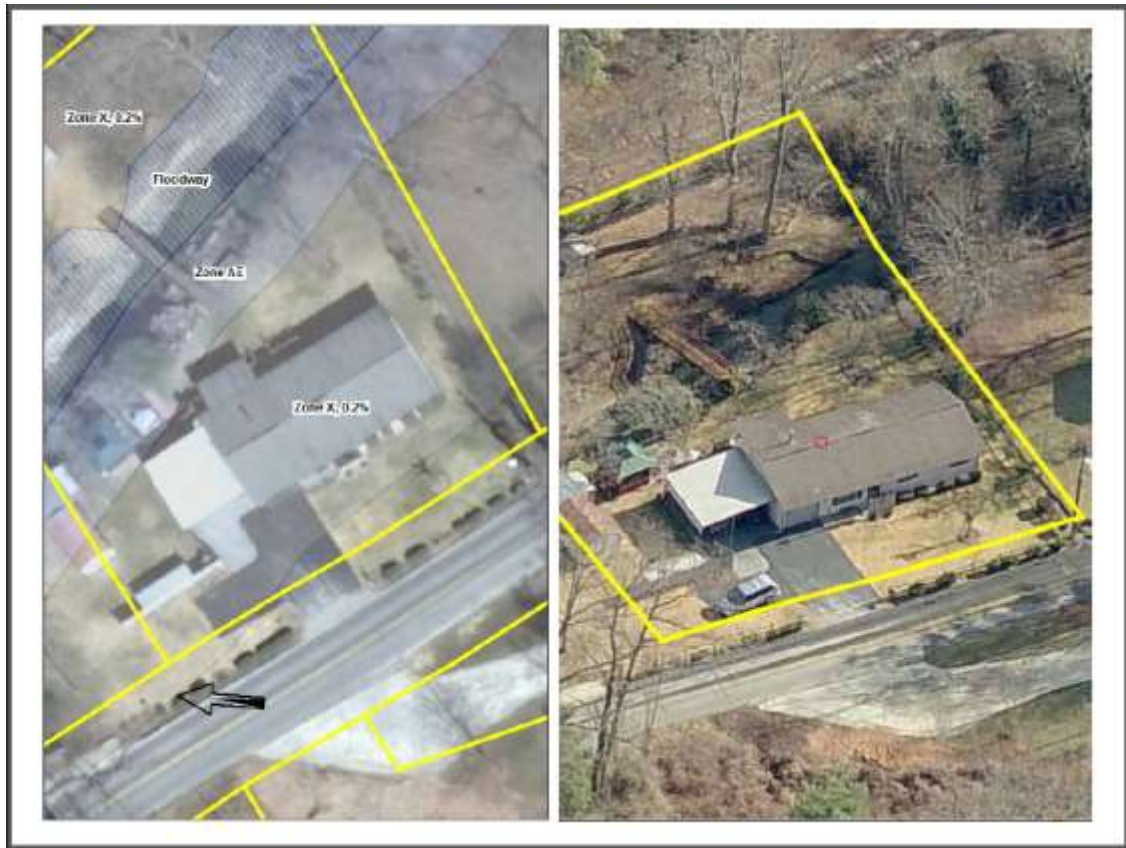
Figure 1. Example of House with Car Port in Ortho Image (what roof on left) with Flood Hazard Zones and Oblique Image (right) Showing Open Sides of Car Port.

oblique image can reveal if a structure is a closed garage or an open car port, with implications for potential damage if located in a flood hazard area (see Figure 1.)