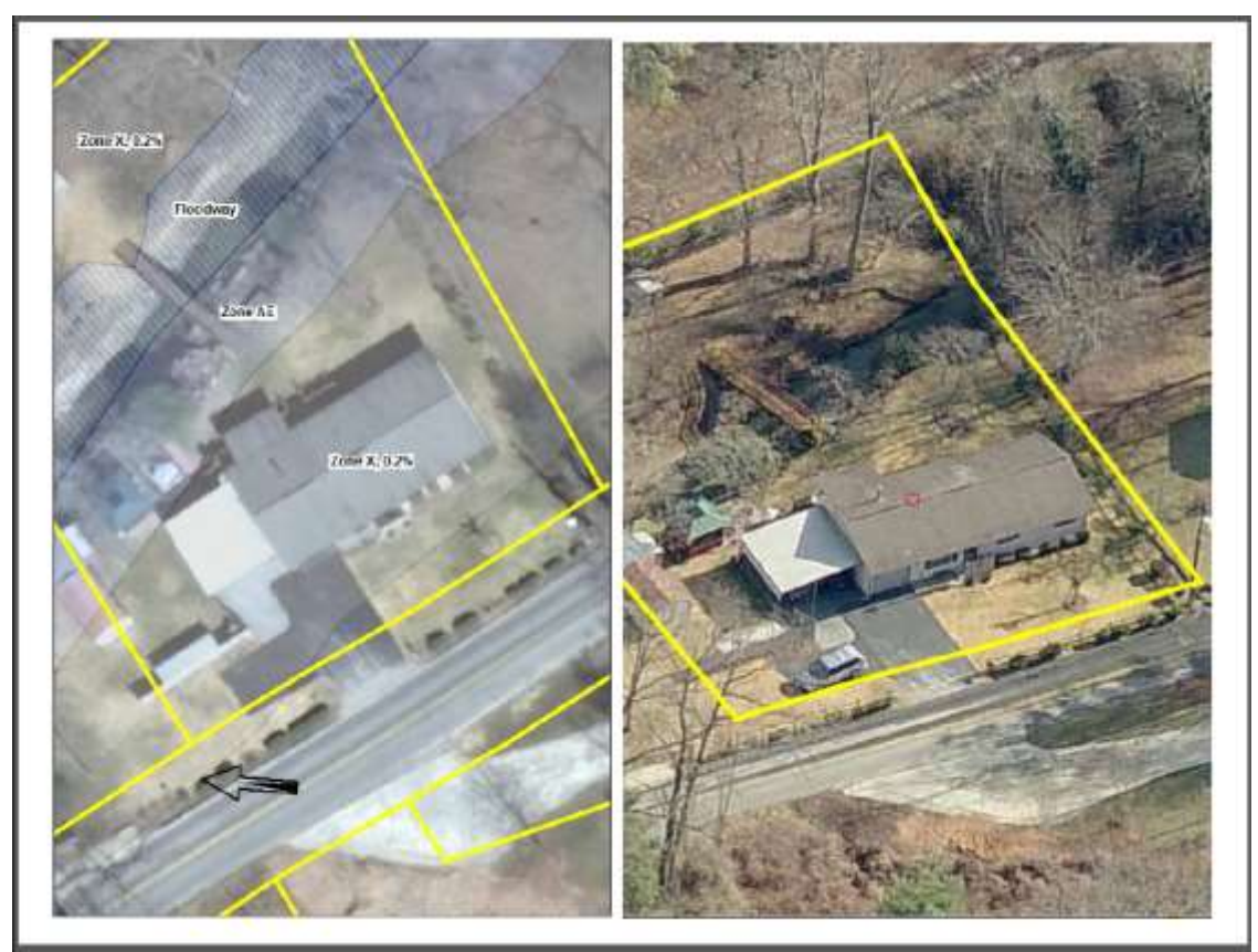
Figure 1. Example of House with Car Port in Ortho Image (what roof on left) with Flood Hazard Zones and Oblique Image (right) Showing Open Sides of Car Port.

oblique image can reveal if a structure is a closed garage or an open car port, with implications for potential damage if located in a flood hazard area (see Figure 1.)