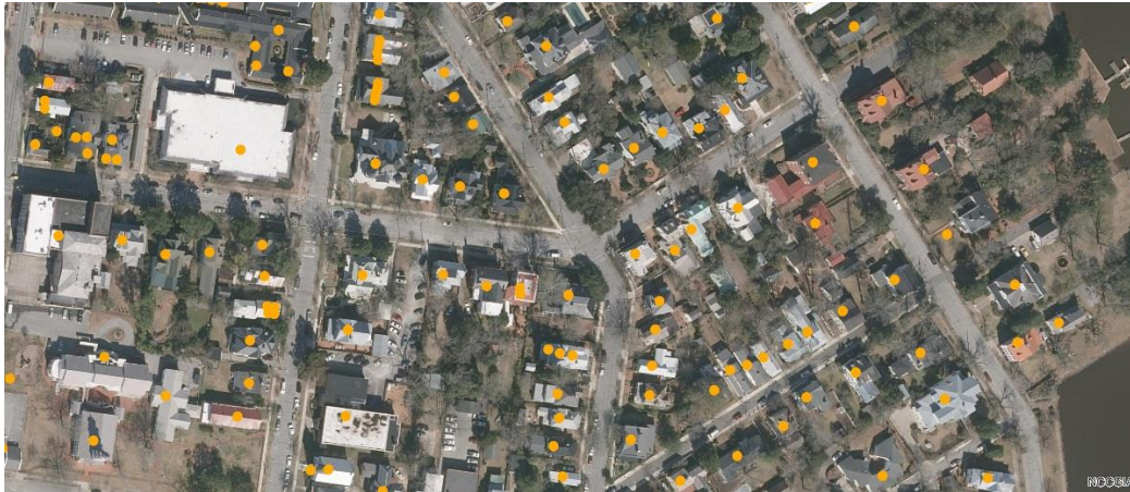
Figure 1. Address points and orthoimagery, City of New Bern example

combined and maintained in standard format and made available to the many state agencies that often seek the same information from localities. Eliminating redundancies and providing a standardized data platform benefits local governments and state government agencies. Maintaining these foundational datasets will also support the Office of State Budget and Management’s State Demographer in annual population estimates.