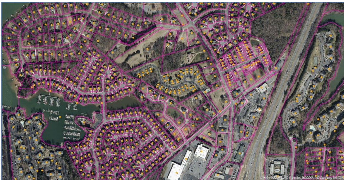
Figure 4: Imagery, parcel boundaries, and address points from NC OneMap , Town of Cornelius (2015)

North Carolina is one of the leading states in maintaining border-to-border land information online as standardized parcels. In a collaborative project involving all 100 counties and the Eastern Band of Cherokee Indians, the Council realized a longtime goal to compile and publish statewide standardized parcels (boundaries and property information), and is maintaining the resource. Combined with statewide aerial imagery, address points, and other foundational geographic data, informative views of the landscape are readily accessible to all counties, the N.C. General Assembly, state agencies, private businesses, educators, and the public. A sample of parcels, address points, and imagery is shown in Figure 4.