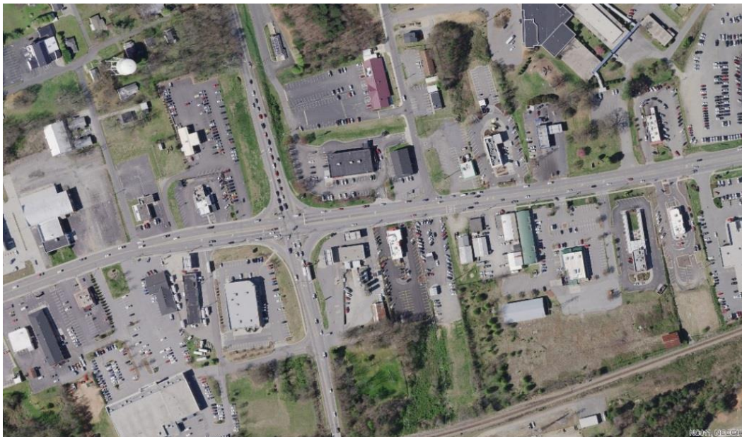
Figure 3. N.C. orthoimagery example in the City of Lincolnton (April 1, 2015)

The imagery is available to state, local, federal, and regional government agencies, as well as the private sector, the academic community, and private citizens as map services and downloadable files from NC OneMap . Benefits include saving time in locating and responding to emergencies, saving time informing business decisions, knowing the date the imagery was captured and its resolution and accuracy, and avoiding the cost of erroneous information from out-of-date or less accurate imagery and map features. An example of orthoimagery with date of capture is shown in Figure 3.