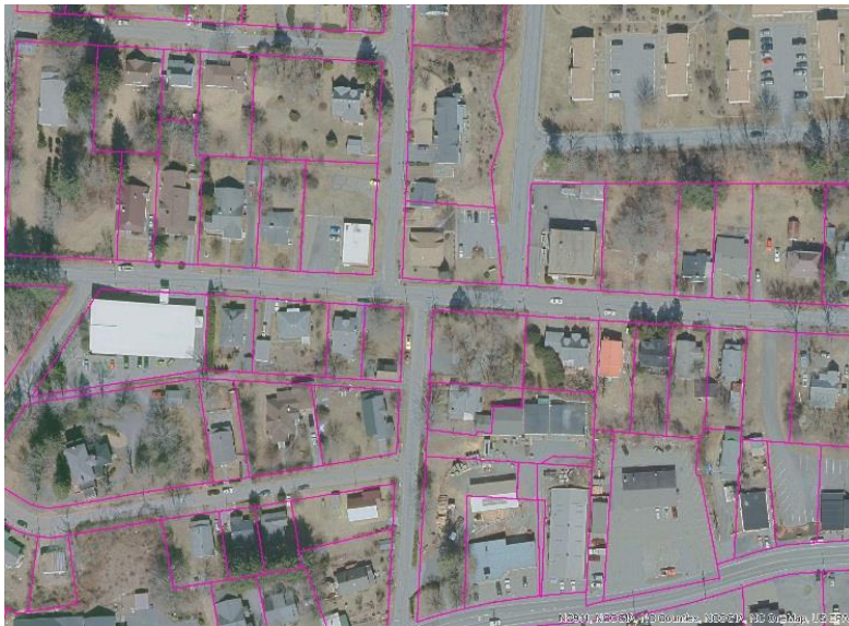
Figure 5. Parcel boundaries over orthoimagery, Spruce Pine, NC

Parcel boundaries indicate patterns of land ownership as shown by the pink lines over statewide aerial imagery in a Mitchell County location (Figure 5). Consistent, complete, current, accessible parcel boundaries with information about location, use, size, and value saves time and money for public and private business processes. As always, counties are the authoritative sources of the most current and detailed parcel data. For detailed research on specific properties, data consumers are directed to online county map viewers and county geographic information system (GIS) contacts.