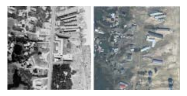
Figure 2: A coastal area before and after the storm.

It became immediately apparent that local governments had a wealth of digital GIS information that could be extremely beneficial to emergency responders. This data was available from over half of the affected counties and the accuracy and currency was much better than the Census data that FEMA has had to rely on. Many examples were given on how digital parcel information from local governments could improve the ability of FEMA and state agencies